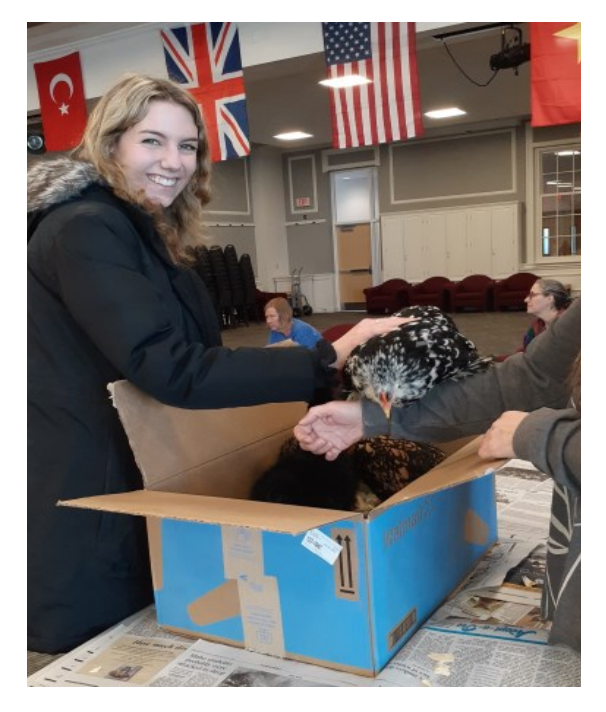
Pet Therapy Days Never Disappoint