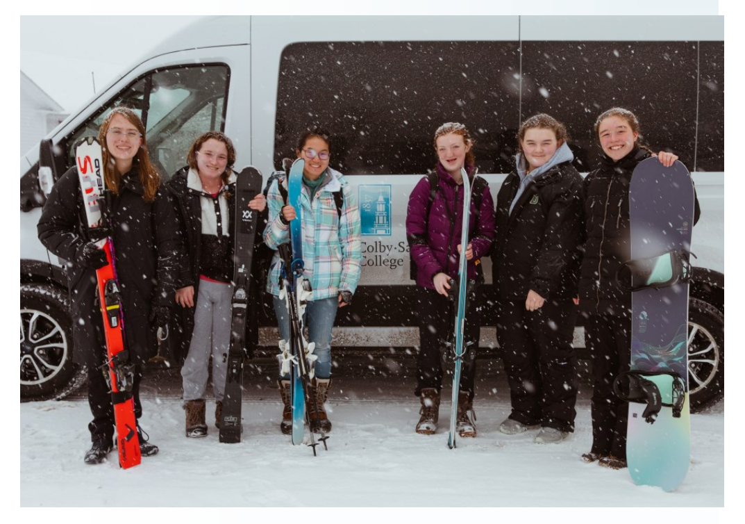
Snowy Sunday at Mount Sunapee this Winter